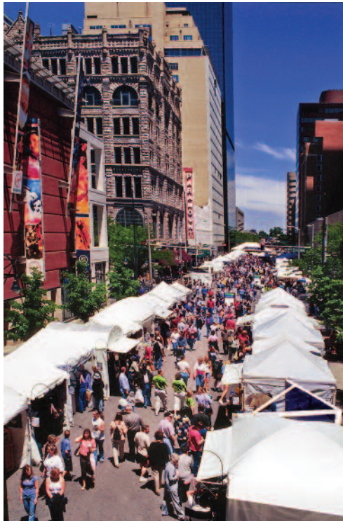
The annual Downtown Denver Arts Festival held Memorial Day Weekend.

Listed at the right are our panel members and their web sites. If you have a chance, take a few minutes and visit them before our meeting.