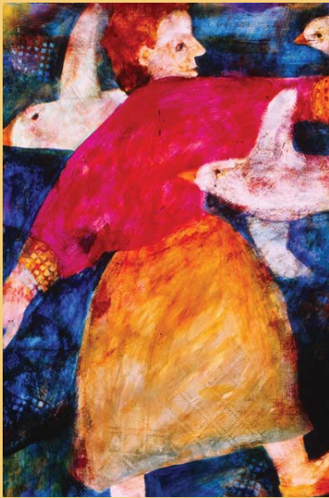
First Place-President's Circle-Joyce Shelton, "Dances with Birds".