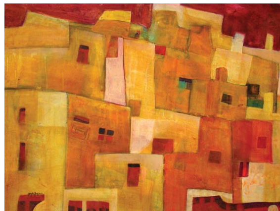
Gayle Gerson, “La Posada” , watermedia on collage, 21 x 29 inches