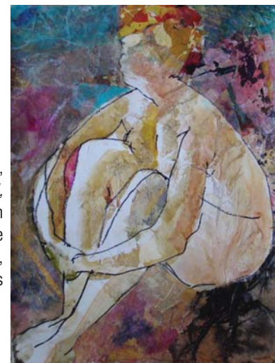
Gayle Gerson, “Basking” , watermedia on collaged tissue paper, 10 x 15 inches

Day to day, Gayle Gerson is pulled into her studio by the “grand luxury of doing art.” She surrounds herself with favorite collage materials: hand-painted tissue paper, old magazines and newspapers, and, yes, failed watercolors! Fueled by music, coffee and creativity, she says, “I feel like I’m dancing in my soul.”