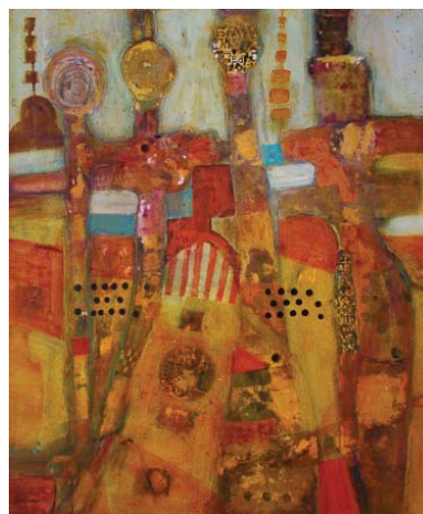
Gayle Gerson, “Ghosts of Africa” , watermedia on yupo, 30 x 26 inches