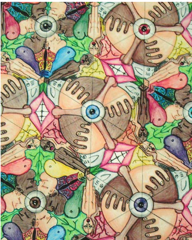
Student Art – High School Winner