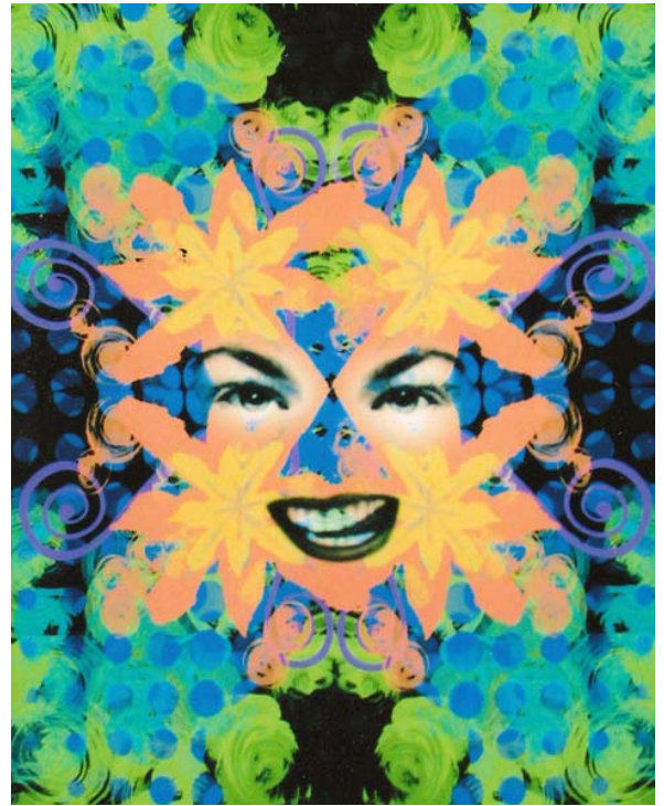
Student Art – Computer art