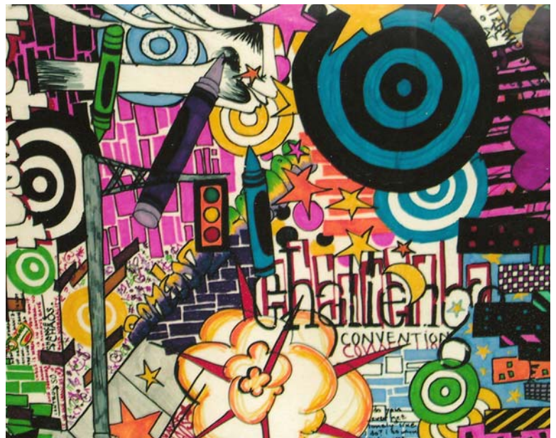
Student Art – High School Winner