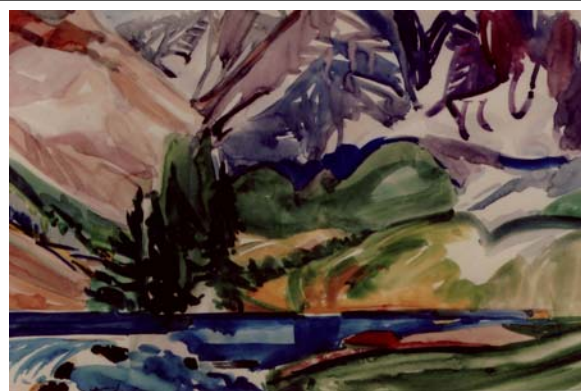
rita derjue, "Maroon Bells Near Aspen," watercolor, 15 x 22