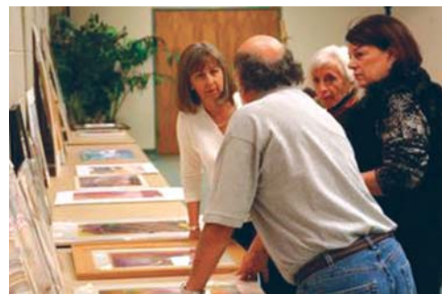
The judges discuss the paintings