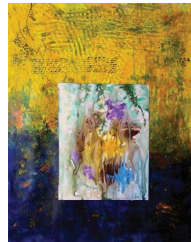
Susan Kacik, "Spring Quiet", mixed media, 22 x 28 inches