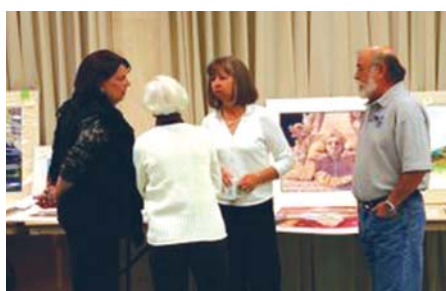
The judges have a discussion before the critiques begin.