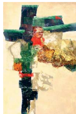
Susan Kacik, "Timeless", mixed media, 11 x 15 inches