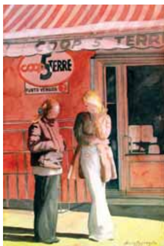
Sandy Applegate, "Coop 5 Terre", watercolor, 21.5 x 14 inches

Sandy's fertile imagination juggles a score of ideas at a time, each of which she may spin into a series of paintings. Her new artwork, for example, is a journey through a kaleidoscope of worlds, from "The Raven" (inspired by the Edgar Allen Poe poem) and the abstract "Orbs," to "Time Pieces" (a thoughtful look at the changing and continuous nature at time) and a tongue-in-cheek take on cowgirl style. With bold shapes and colors, she veers between realism and abstraction, serious subjects and whimsy. Even her media is eclectic - mainly acrylic, but often a mixture of watercolor, pen and ink and colored pencil for unusual effects.