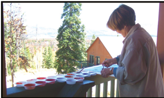
Watercolor, Fabric Arts, Personal Life Coaching

Remember taking your kids to camp and wishing you could stay too? Now it's YOUR turn!