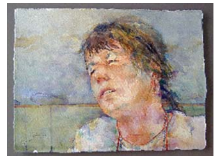
Susan Spear, "Sun and Wind", watercolor, 11.5x15 inches