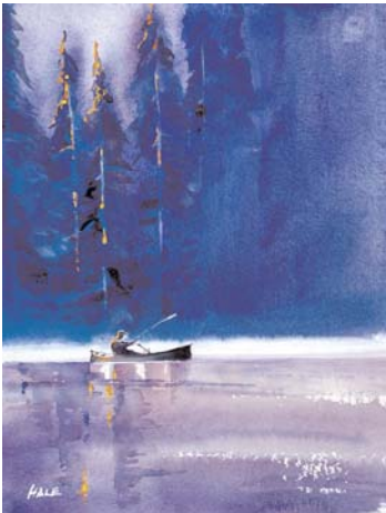
Randy Hale, "Gone Fishing", watercolor, 14 x 10 inches