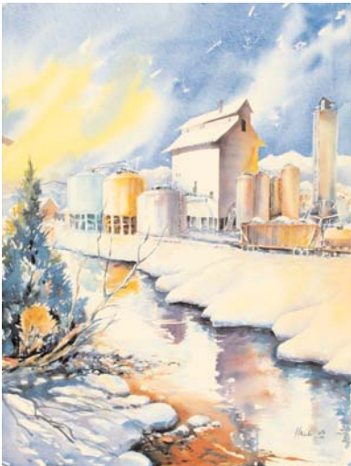
Randy Hale, "Platte River Dawn", watercolor, 22 x 30 inches