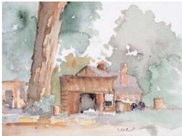
Lionel Sanchez, Downtown Littleton Street Scene, watercolor sketch