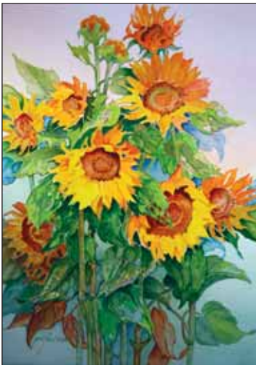
"Nature's Sundial" Watercolor by Pat Fostvedt