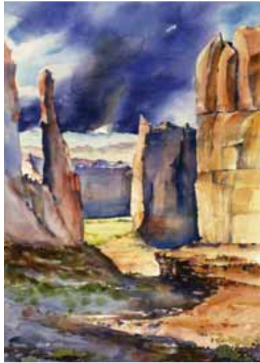
"Arches," Watercolor, by Randy Hale

For those members who conduct workshops, our CWS newsletter – the Collage – offers a communication tool that reaches your target market. And, members who advertise receive a discounted rate! Further, we offer a forum at our monthly meetings for you to announce your workshops or activities and distribute literature to our membership.