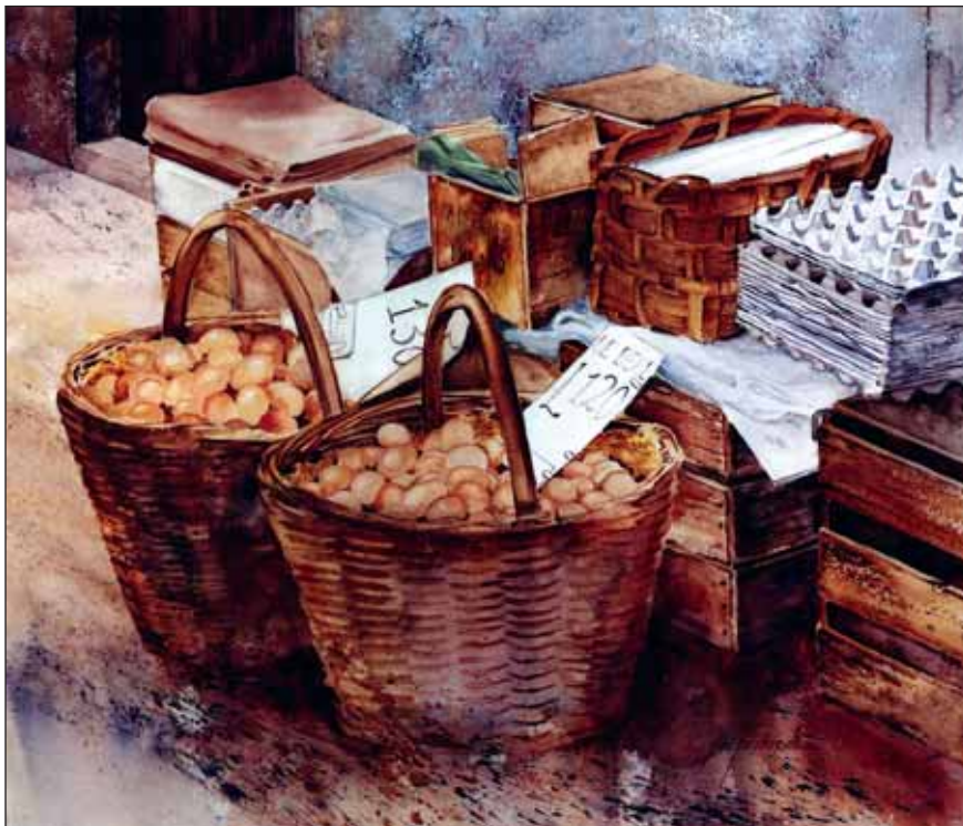
"Venice Street Market" watercolor by Pat Fostvedt