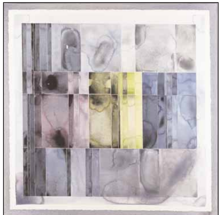
"Elementals No. 18", watercolor on paper mounted on canvas, 36 x 36". 2007 Rocky Mountain National Watermedia Exhibition at Foothills Art Center.

Over the next few months, I plan to share some ideas on the future of the Collage . At any time, though, I really welcome input from all members – this is your newsletter after all. What would you like to see? Send me your ideas for articles or features anytime. I'll also be looking to get more general members involved in creating the Collage , especially those interested in "reporting" – whether as a regular contributor or a guest writer. Let me know how you'd like to be involved – my contact info is on the front page!