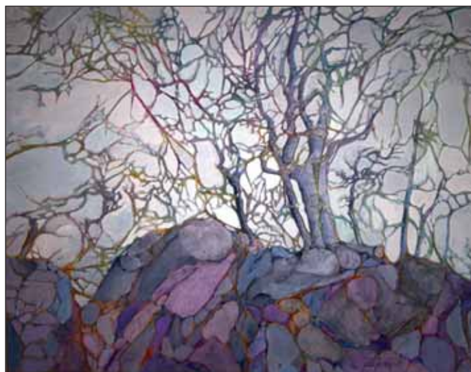
"Tangled Trees" Watercolor by Pat Fostvedt