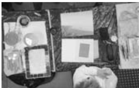
overhad shot of Demonstration